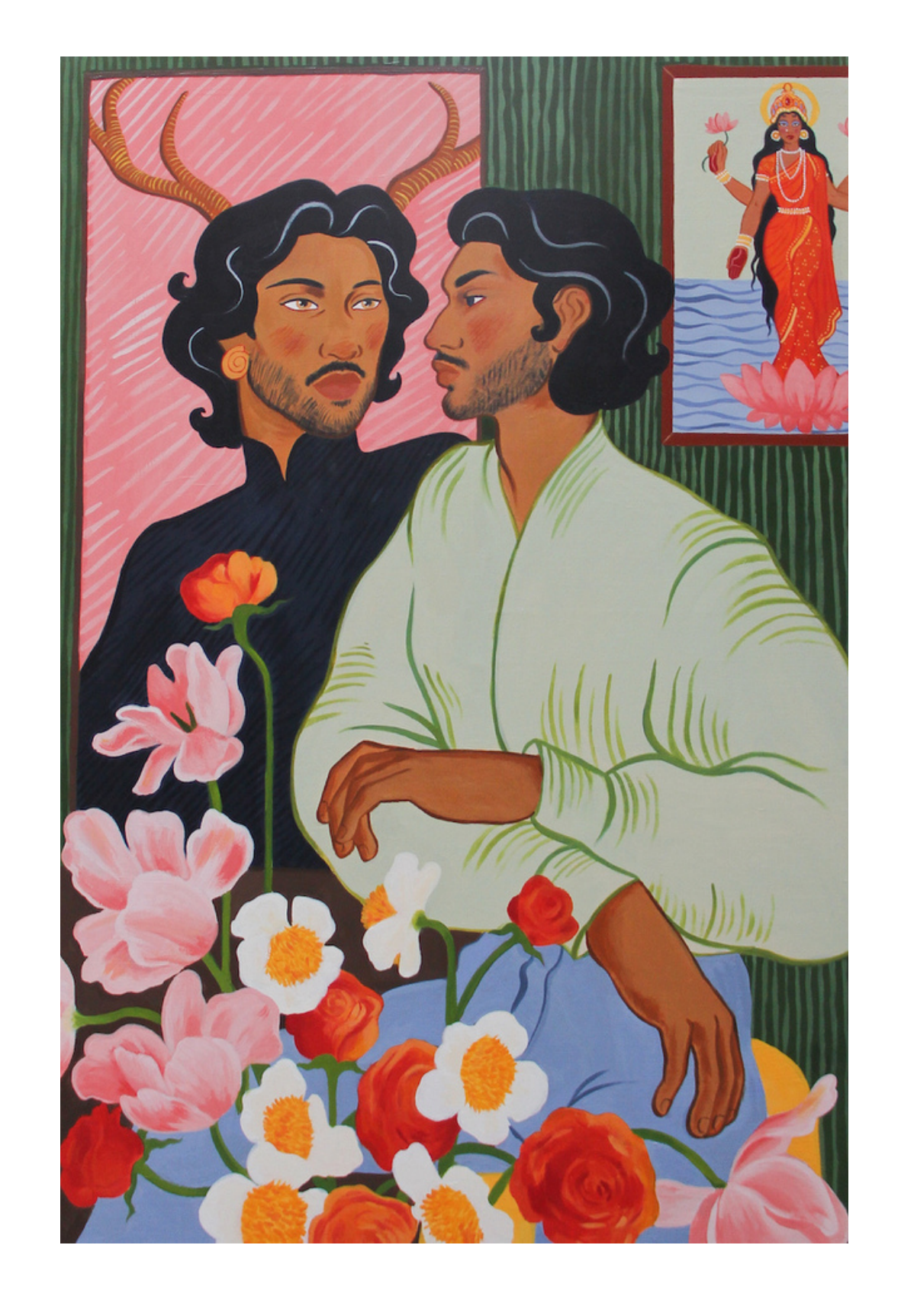
Đỗ Tuấn-Anh, Fragile #2 , 2018, acrylic on canvas | © Galerie BAQ

Richie Nath, Where are you?, 2023, acrylic on canvas | © Galerie BAQ