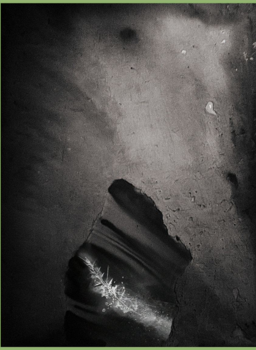
Đỗ Tuấn-Anh, Fragile #3, 2018, acrylic on canvas © Galerie BAQ